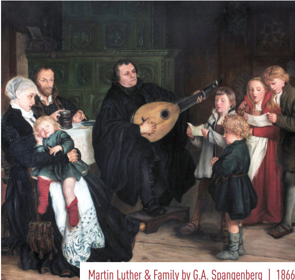
Martin Luther & Family by G.A. Spangenberg | 1866

MEDIEVAL AND RENAISSANCE: Musicus thinks and speculates about music; a cantor sings and practices music; a compositor composes.