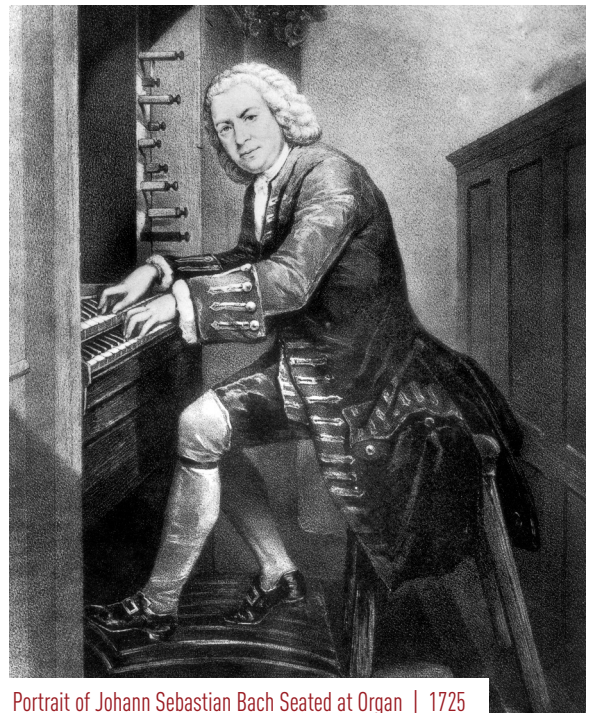
Portrait of Johann Sebastian Bach Seated at Organ | 1725

17TH AND 18TH CENTURIES: The academic load of cantor lessened as musical demands, especially composing, increased; they eventually lost the faculty position, but remained second to the rector in church; the cantor was a servant of the people and master of the music of the common people, being concerned for them, and making them active participants; this period saw the flowering of Lutheran liturgical—musical stance in J. S. Bach, but the simultaneous dismantling of liturgy, music and the cantor's role with Pietism and Rationalism.